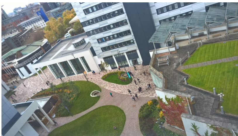
Photo 1: Glasgow Caledonian Campus situated in the heart of Glasgow.

Top-ranked candidates will be interviewed during March and the final selection is made until mid April.