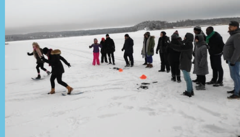
Photo 3. Snow experiences in Finland

MURCS students arrived in Lahti at the beginning of January. The students got acquainted during Finnish winter sports and games in Asikkala.