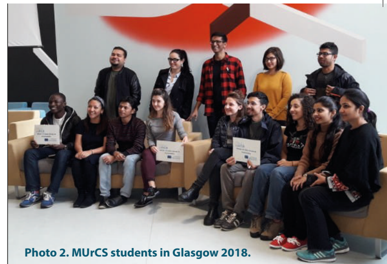
Photo 2. MURCS students in Glasgow 2018.