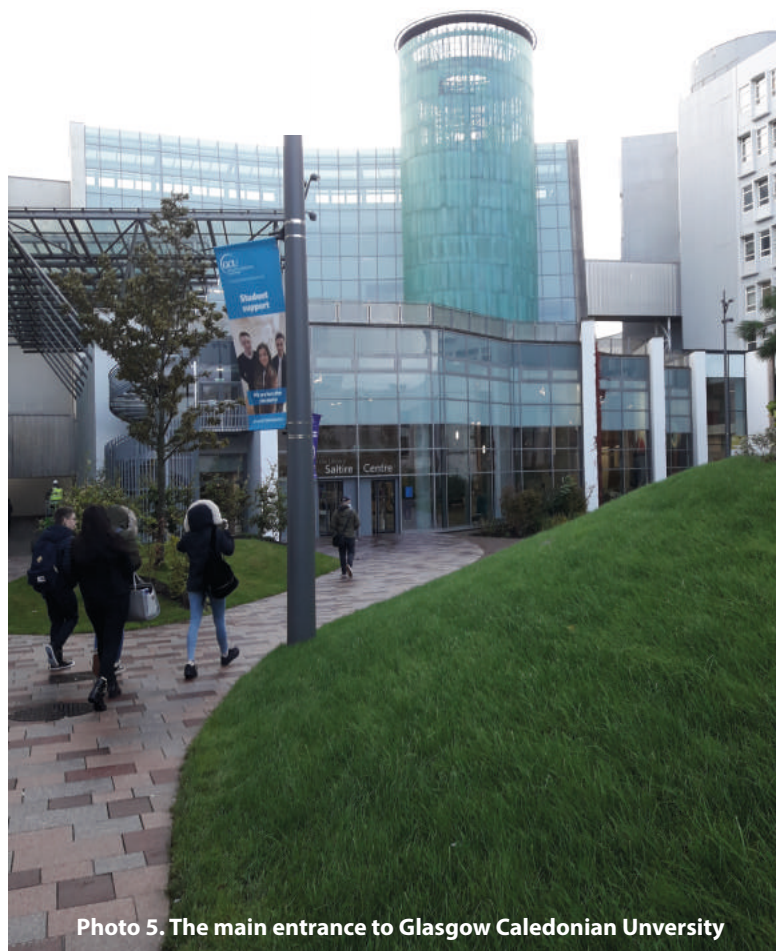
Photo 5. The main entrance to Glasgow Caledonian University