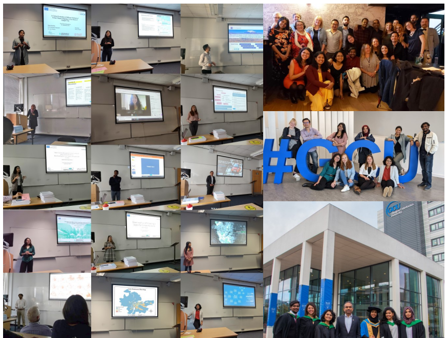
Figure 1. MUrCS Cohort 02 thesis presentation sessions (left), Thesis completion dinner and graduation ceremony held in Glasgow (right)