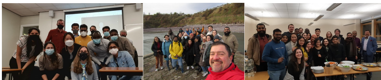
Fig 03_ Students attending Sustainable cities course in GCU (leftmost), Excursion to Catterline Bay (middle), Christmas dinner with students and faculty members at GCU (rightmost)

Cohort 4 students have completed their in-person course sessions in Glasgow and participated in multiple activities such as an excursion to Catterline Bay on November 25 th 2021. To view the activities: Link to Video . The students also went on a walking tour to visit significant places in Glasgow on November 30 th . The students had the Christmas dinner at the University on December 1 st . The students are going to Lahti to pursue their second semester in Finland starting in January 2022.