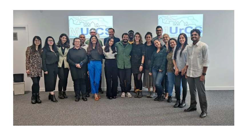
Figure 2. Viva voce examination held in Glasgow