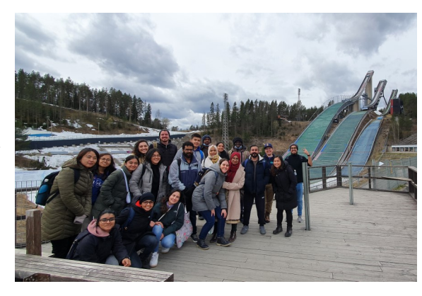
Figure 3: Cohort 04 group picture in Salpausselkä Geopark in Lahti

Meanwhile studying in Finland, cohort also experienced first intensive study period which was held at HTW Dresden for three weeks, including Urban Ecosystems and Nature-Based solutions module and Research Methods week. The carefully planned program by our German partners was followed with success and enjoyment, thus marking the successful integration of HTW Dresden into the MUrCS 1.5 Consortium. In addition, staff from partner universities also met at the Consortium Board Meeting which took place on 19th of May 2022. Summary of Cohort's time in Dresden: <a href="https://www.youtube.com/watch?v=KwFq-a99GZ4&t=3s">https://www.youtube.com/watch?v=KwFq-a99GZ4&t=3s</a>