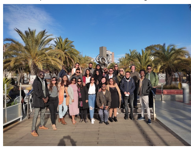
Figure 1. MUrCS Cohort 03 group picture from Huelva

MUrCS cohort 03 students have successfully finished their short semester period in University of Huelva and moved to the thesis writing (Figure 1). By 11th of September, all student members of the Cohort have submitted their master thesis projects and additionally gone through viva voce examinations. Cohort attended their master thesis project presentations and viva voce exam at Glasgow Caledonian University from 3rd to 4th of October 2022. It was the in-person thesis presentation held by MUrCS, and all the sessions were carried out by short presentations by the students and follow-up questions from the supervisors. (Figure 2). The students attended thesis completion dinner with the faculty members and staff on the 4th of October in Glasgow. MUrCS proceedings 2022 are expected to be available online during December 2022.